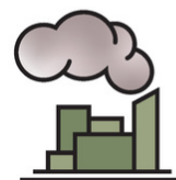
Sources of air pollution